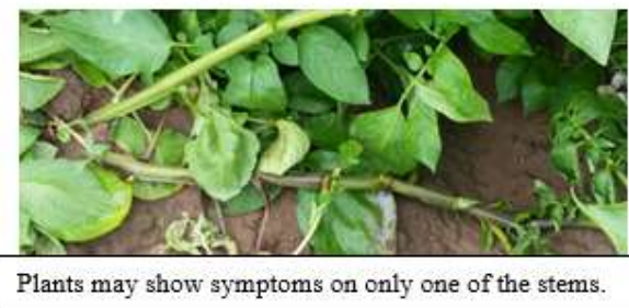
Plants may show symptoms on only one of the stems.