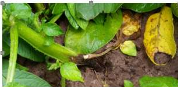
Stem lesions are mainly seen at the base of the stem.

The primary bacterial pathogens that cause potato blackleg and tuber soft rot are Pectobacterium atrosepticum , P. carotovorum , P. wasabiae , and more recently in the U.S., Dickeya spp. Previously, all of these pathogens were grouped in the same genus Erwinia . Dickeya and Pectobacterium affect many host species including potato, carrot, broccoli, corn, sunflower and parsnip; legumes and small grains are not known hosts. Dickeya dianthicola was confirmed in the eastern U.S. in just 2015, causing significant potato losses in some areas. Dickeya appears to spread over long distances via seed potatoes, was first reported in the Netherlands in the 1970s, and has since been detected in many other European countries, and now the U.S. Pictures, below, show symptoms of Dickeya .