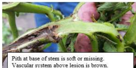
Pith at base of stem is soft or missing. Vascular system above lesion is brown.