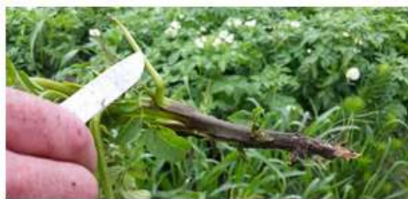
Decayed stem is a dull brown.