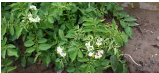
Leaves of plants with milder symptoms are curled.