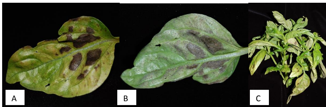
Figure 1. Basil downy mildew symptoms and signs. A. Topside of leaf (note yellowing or chlorosis and brown, dead lesions). B. Underside of leaf (note patches of gray-purple fuzzy pathogen sporulation). C. Portion of whole plant infected with downy mildew (note yellowing and curling of lower leaves, along with brown lesions).

To determine when to initiate a fungicide program, or when to harvest early to avoid losses, growers should routinely scout for disease, and should stay informed of disease reports within the region to determine when downy mildew is occurring. The cucurbit downy mildew forecasting web site ( http://cdm.ipmpipe.org ) might be useful for predicting when conditions are favorable for basil downy mildew since both pathogens likely have similar requirements for successful wind dispersal and infection. Basil crops should be disked under or otherwise destroyed as soon as possible after last harvest, or when abandoned because of disease, to eliminate this source of inoculum.