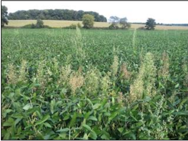
Figure 1. Horseweed plants late in the 2012 growing season that were not controlled with a previous postemergence glyphosate application in a no-till soybean field in Jefferson County, Wisconsin.

An initial glyphosate screening experiment and two glyphosate dose response experiments were conducted in the greenhouse at UW-Madison to compare the effective dose needed to reduce plant shoot biomass by 50% ( ED_{50} ) between the collected Jefferson County population and a suspected susceptible population (Figure 2). The ED_{50} of glyphosate was estimated to be 1.59 \text{ kg ae ha}^{-1} ( 40 \text{ fl oz ac}^{-1} ) and 0.28 \text{ kg ae ha}^{-1} ( 7 \text{ fl oz ac}^{-1} ) for the Jefferson County and susceptible population, respectively (Figure 3). Therefore, the glyphosate-resistant plants from Jefferson County were nearly six-fold resistant compared to susceptible plants.