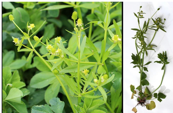
little leaf buttercup ( Ranunculus arbotivus ) shown in alfalfa. Height as shown is 12 inches.

http://www.coolbean.info/library/documents/Soybean_nReplant_2014_FINAL.pdf