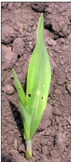
Black cutworm feeding damage by small larvae on young corn plant.

Initial damage to corn seedlings by early instar black cutworm larvae shows up as holes or irregular feeding injury to corn leaves. Small larvae are not yet able to cut plants and this injury is not economic. However, it does indicate potential for cutting or tunneling into the base of the plant by larger larvae. By contrast, seedcorn maggot and wireworm feeding may also occur early season, but their feeding is confined to lower leaves (first and second leaf) and below ground.