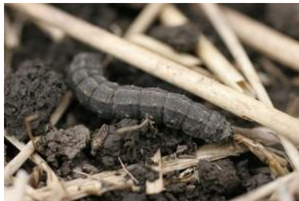
Black cutworm larvae

plant, but they can burrow into the corn plant below ground level.