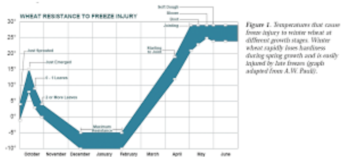
Figure 1. Temperatures that cause freeze injury to winter wheat at different growth stages. Winter wheat rapidly loses hardiness during spring growth and is easily injured by late frosts (graph adapted from A.W. Paul).

Lastly, growers may also be questioning the impact of temporary flooding within fields. Though crop injury from this flooding may occur that damage will likely be limited due to cool temperatures and slowed crop respiration. Any crop injury that does occur will directly be related to the duration of the flooding event .