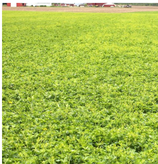
Little leaf buttercup (weed with yellow flower) shown infesting a spring alfalfa field.

Buttercups, have been showing up this spring in pastures and hayfields in southern Wisconsin. While Wisconsin has 18 species of buttercup, little leaf buttercup ( Ranunculus arbotivus ) is the most commonly seen in production fields. This species is native to Wisconsin and can behave as a biennial to short term perennial. While this plant can be found every year in the state (common in our forests), it is probably more common this year in hayfields and pastures due to overgrazing and poor regrowth from the summer droughts of 2012 and 2013. These conditions likely allowed for establishment and increased populations compared to “normal years”.